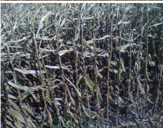
IMAGE COMMENTS: As indicated in the test comments, soil compaction was very evident in areas of this location. The pictures above try to show the compacted areas where corn growth and yield was vastly inferior to adjacent non-compacted soil areas. Note the barren stalks in the bottom picture.