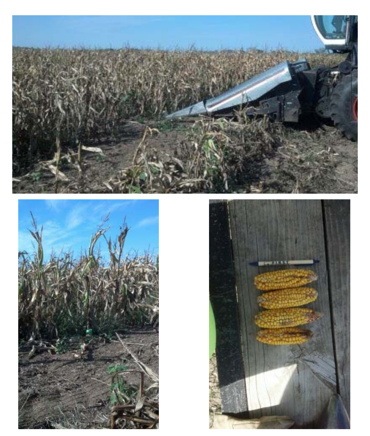
IMAGE COMMENTS: The drought of 2012 hit this Braymer location hard. Most plants produced either no ears or barren ears. Some of the best ears we could find are shown in the picture above.