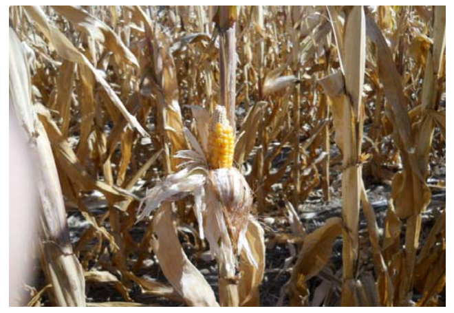
IMAGE COMMENTS: These pictures show the short plant height, barren stalks, and small ears (if any). If ears had kernels, they were typically located next to plant-free alleys at the end/beginning of plots.